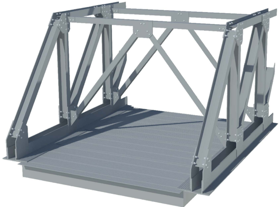
Truss-Supported Flat Panel Cover

Element 13's covers are completely customizable to your needs. We can provide all sizes or configurations and meet any design loading requirements.